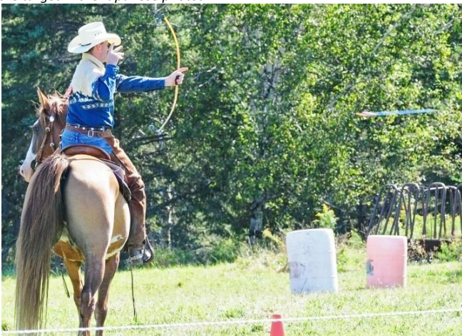
What's this? A cowboy shooting a bow and arrow from horseback – now I have seen everything.