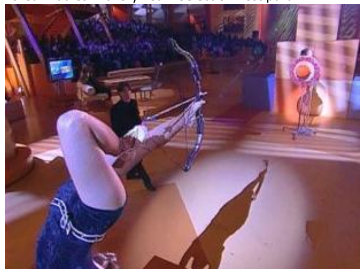
After this a FITA70 will seem like childs play.