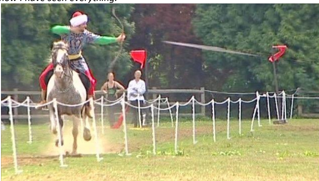
Asian and Eastern European horse archery has a long tradition.