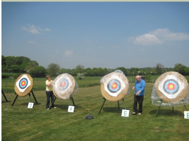
Rather than show more photos of the various winners, as these can be seen on the club web site, I thought I would include a photo of volunteers setting up the field for the shoot.