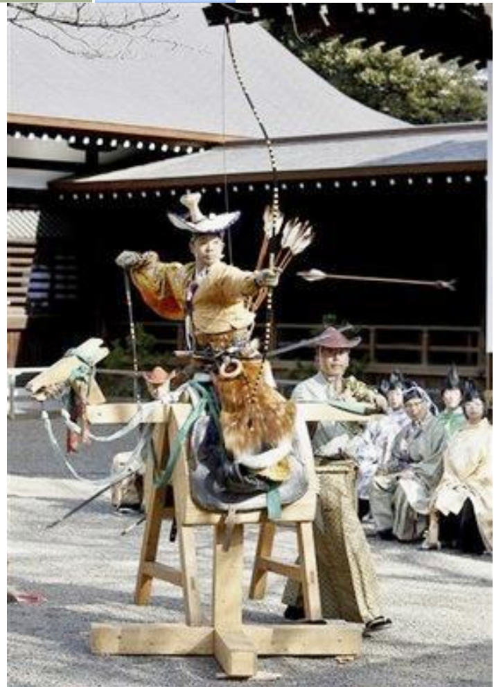
Only in Japan would you have spectators sitting watching a guy sitting on a wooden horse shooting arrows.